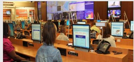
During CDC's Zika virus response, 10 of 35 PMFs supported the agency's activities either in the Emergency Operations Center or on location in Puerto Rico.

PMF fellows produce important work to help advance public health. Fellows have made significant contributions to public health policy, program planning and evaluation, and strategic communications at CDC and across