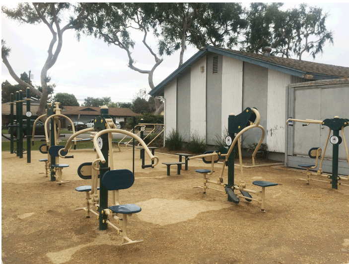
Figure 1. Fitness zone in Eastgate Park, Garden Grove, 2016.

Eastgate Park is a 4.5-acre park in a suburban community in northern Orange County and has amenities such as open green space, a children's playground, a community pool, a meeting facility, and a covered picnic area. The fitness zone in Eastgate Park was installed in December 2015 in a previously open space. The city's parks and recreation department worked with Greenfields Outdoor Fitness Equipment, Inc (15), an Orange County-based company, to install 8 pieces of equipment: a 2-person lateral pull, a 2-person back and arms combination resistance, a 2-person vertical arm press, a 2-person chest press, a set of combination bars, a 2-person sit-up bench, a parallel dip and stretch machine, and poly-metric steps (Figure 1).