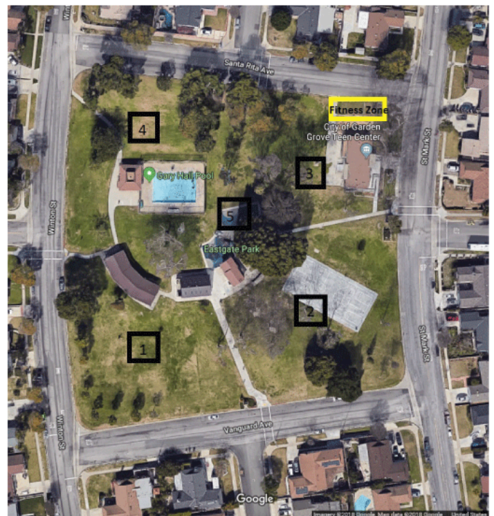
Figure 2. Aerial map of Eastgate Park, Garden Grove, 2015. Researchers divided the park into 5 target areas. Target area 3 encompasses the site of the fitness zone, which was installed in December 2015. Image obtained from Google Maps ( www.google.com/maps/place/Eastgate+Park/@33.7884134,-118.0346572,156m/data=!3m1!1e3!4m5!3m4!1s0x80dd2f26e4a34b8b:0xfb28efa20564369!8m2!3d33.788409!4d-118.03411 ), and graphics were added by the researchers.

preintervention (before installation of equipment) and postintervention (after installation), we used the System of Observing Play and Recreation in Communities (SOPARC), a standardized observation tool (16). To quantify physical activity in the park as a whole, we divided Eastgate Park into 5 target areas (Figure 2). Trained researchers made preintervention observations during 3 days in 2015 (August 29, August 31, and September 2) and postintervention observations during 3 days in 2016 (February 1, February 3, and February 6). Each target area was monitored by a researcher during 4 one-hour intervals (7:00 to 8:00 AM, 12:00 to 1:00 PM, 3:30 to 4:30 PM, and 6:00 to 7:00 PM) on all 3 study days (Monday, Wednesday, and Saturday). According to SOPARC guidelines, we divided each hour into 15-minute increments, and we sampled user activity continuously during each increment.