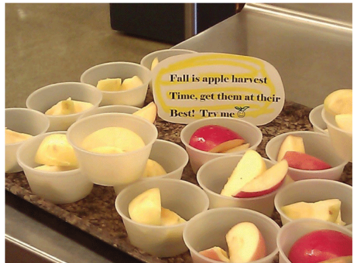
Figure 1. Displays from a behavioral economics intervention on the effects on food choices and food consumption in middle-school and high-school cafeterias, King County, Washington, 2013–2014.

At the beginning of the 2013–2014 school year, a technical team (district dietitian, kitchen manager “leader,” university-based school nutrition specialist, and CTG project lead) assisted the kitchen managers in developing work plans based on strategies covered in the training. The team provided implementation support throughout the school year through site visits and telephone calls (one per school per month, on average). At a second half-day workshop for participants in October 2013, the content expert reviewed principles and strategies and facilitated discussion of suc-