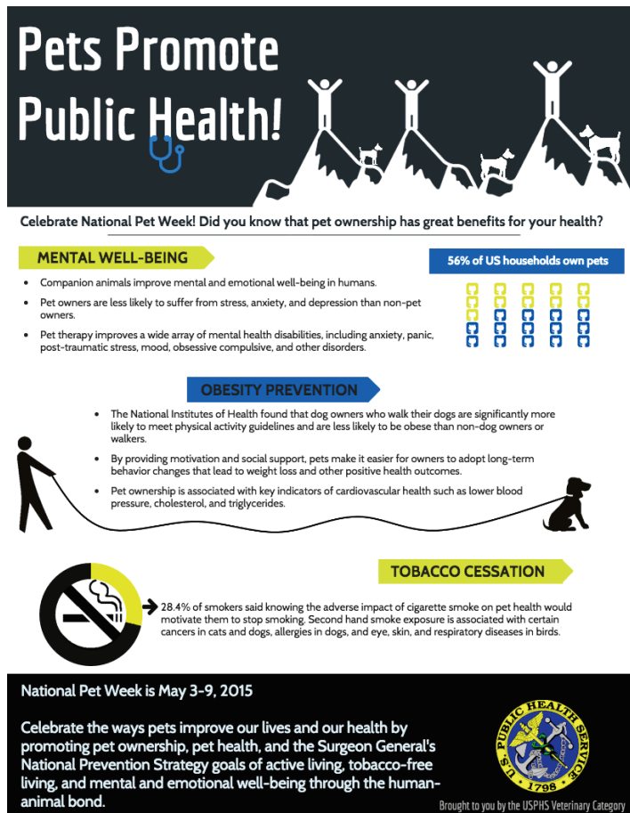
Figure 1. US Public Health Service flyer, “Pets Promote Health,” describing benefits of pet ownership.

Children may interact with dogs in other ways that may benefit them. From a mental health standpoint, children aged 7 to 8 often ranked pets higher than humans as providers of comfort and self-esteem and as confidants (11,12). Animal-assisted therapy (AAT) with dogs affects children’s mental health and developmental disorders by reducing anxiety and arousal or enhancing attachment (13). Because dogs follow human communicative cues, they may be particularly effective agents for children’s emotional development (14). Despite the evidence for the therapeutic effects of AAT for certain childhood conditions, little evidence is available for primary care providers to use when counseling parents regarding the benefits of pet dogs for young children.