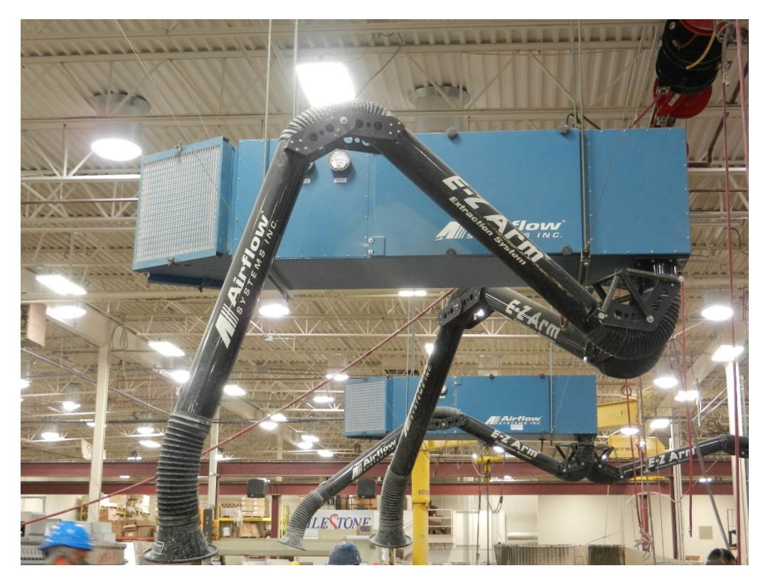
Figure 3. Two air cleaners, each equipped with two E-Z Arm<sup>®</sup> High Flow Extractors.