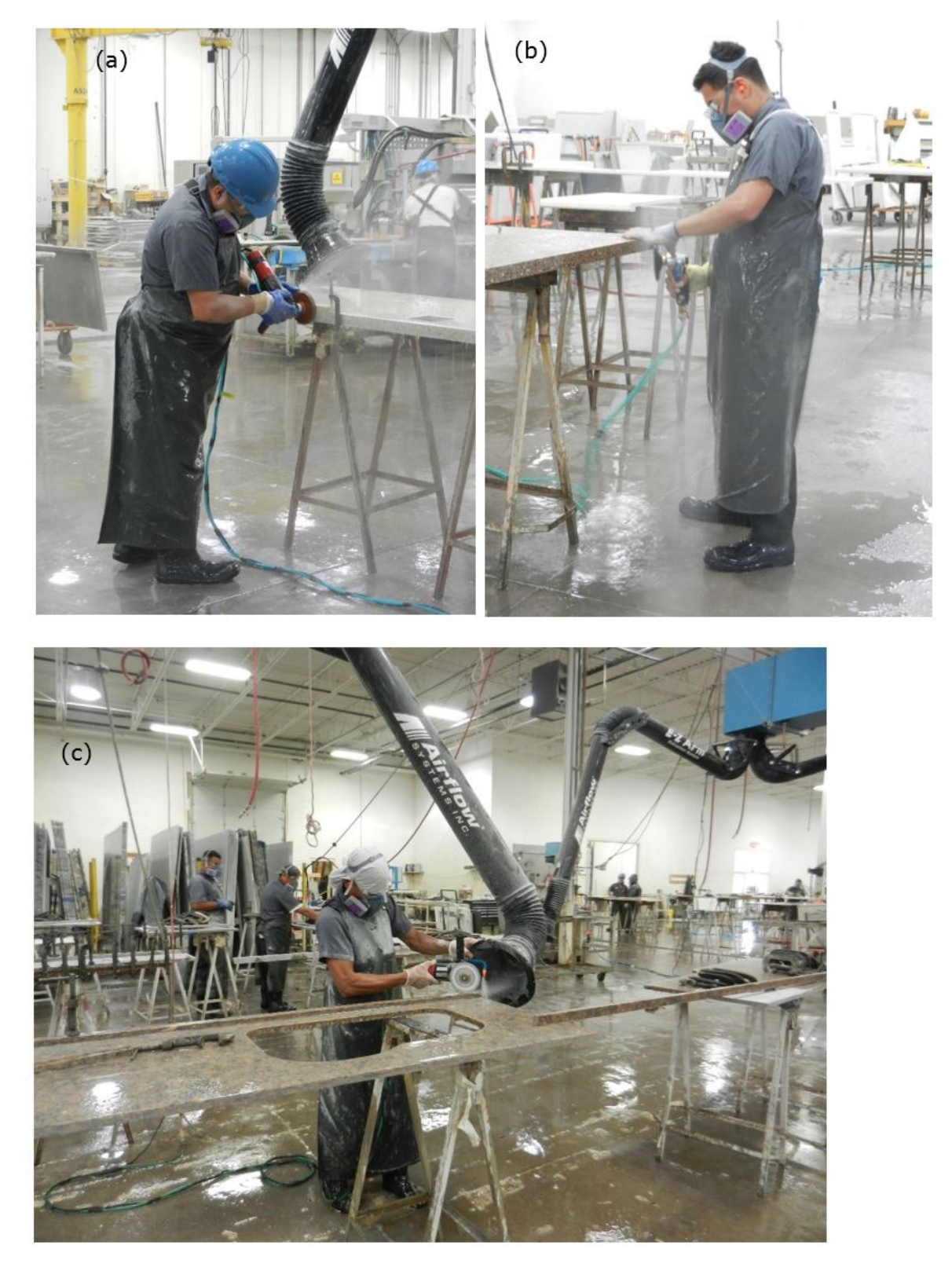
Figure 1 – (a) A worker using a handheld electric wet grinder with a diamond grinding cup wheel in the grinding process; (b) A worker using a handheld pneumatic wet polisher in the