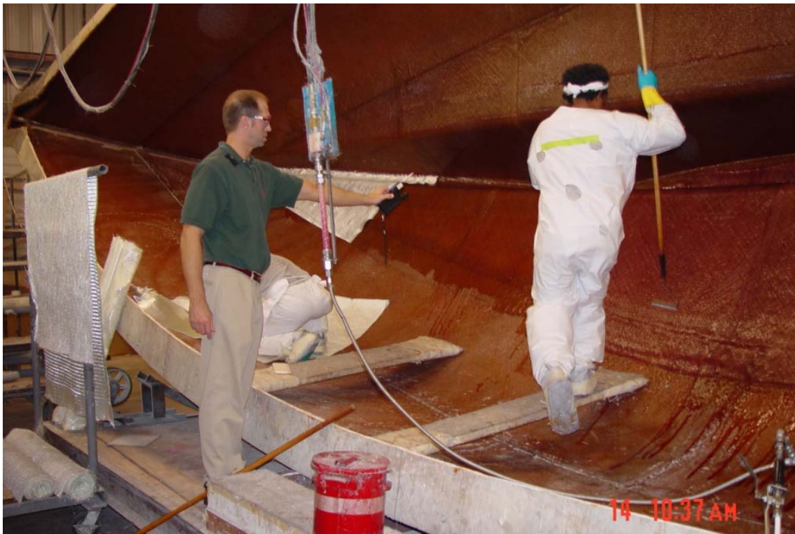
Figure 1: NIOSH researcher taking styrene detector-tube sample during hull lamination

Resin is not sprayed during lamination. The resin is released through perforated rollers attached to a long hollow stick-rolling apparatus. (See Figure 1). A handle is used to control the flow through the roller. A catalyzed pump mixer is attached to the device which activates the resin when the catalyst is introduced. This mobile device allows for close proximity to the hull surface while keeping the styrene vapor in the air to a minimum and the worker's breathing-zone as far away from the hull surface as possible.