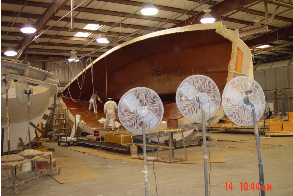
Figure 3: A series of industrial fans carefully oriented to remove styrene vapor from worker's breathing-zone