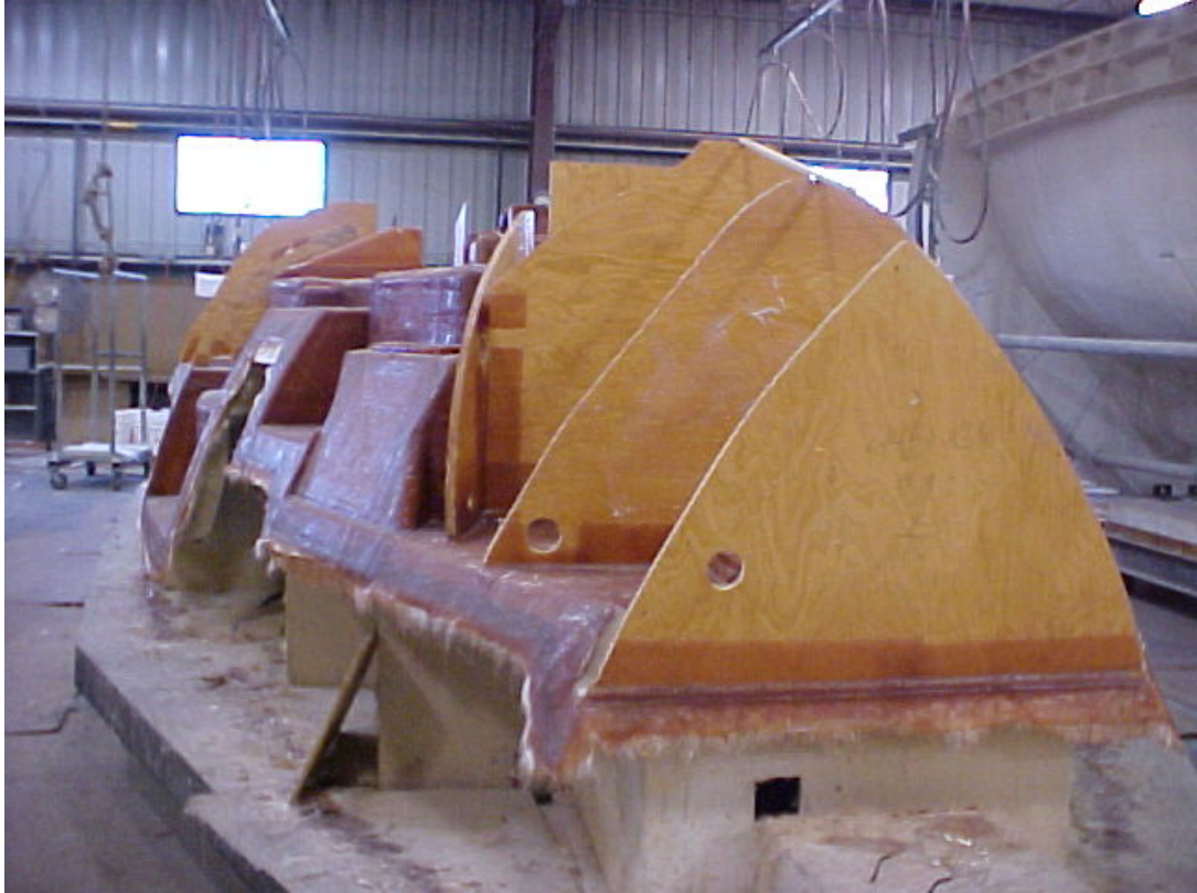
Figure 2: Photo of assembled Internal Glass Unit (IGU), upside down

and placed on the working area. Pieces of wood are inserted throughout the internal glass unit for ease of attachment of interior furniture or flooring at a later time. Gloves, safety glasses, and Tyvek® suiting are worn by all laminators. There are approximately six employees working on this part at one time.