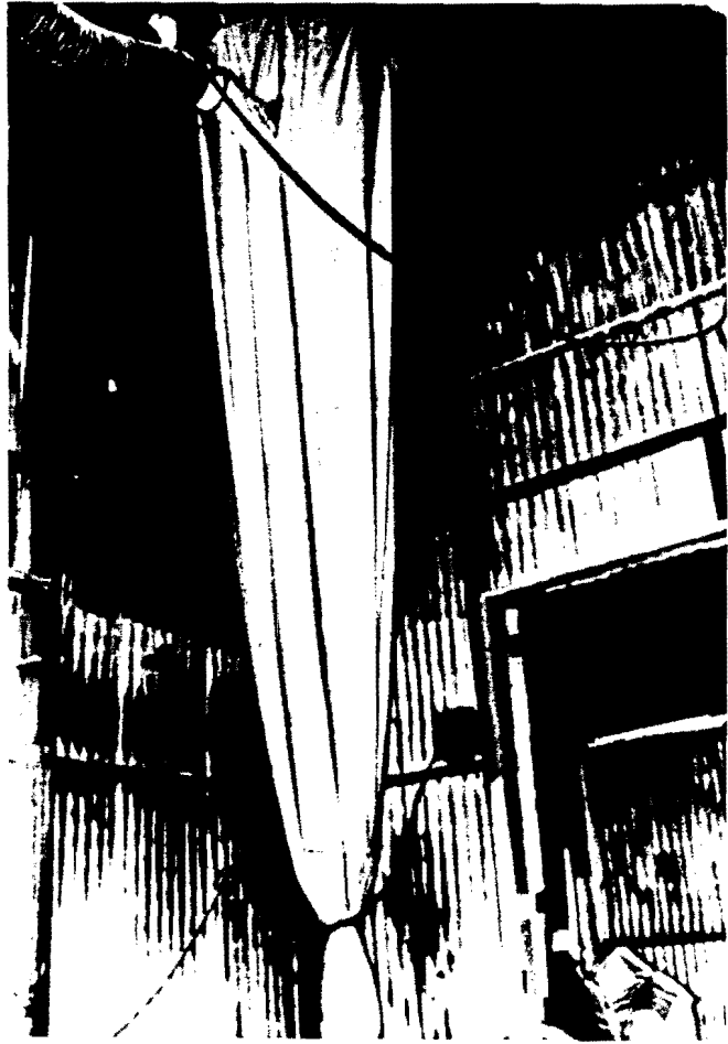
Figure 3. Filter Bag for Removing PMA from Exhaust Air.