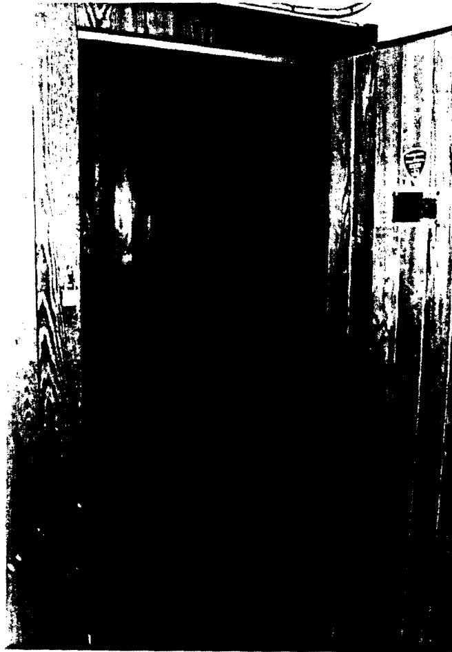
Figure 5. Sauna.