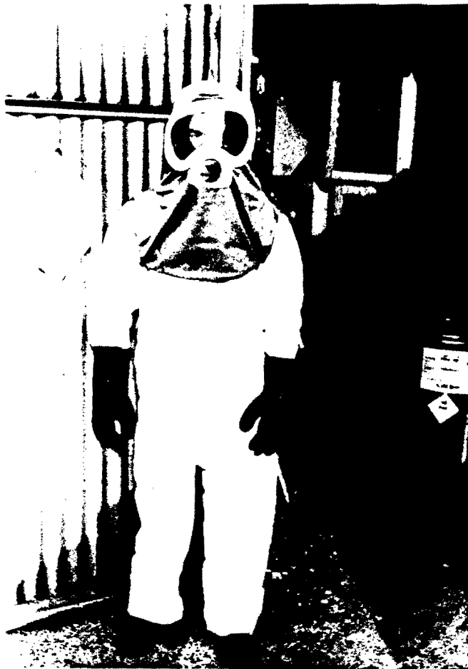
Figure 4. Respirator with Hood.