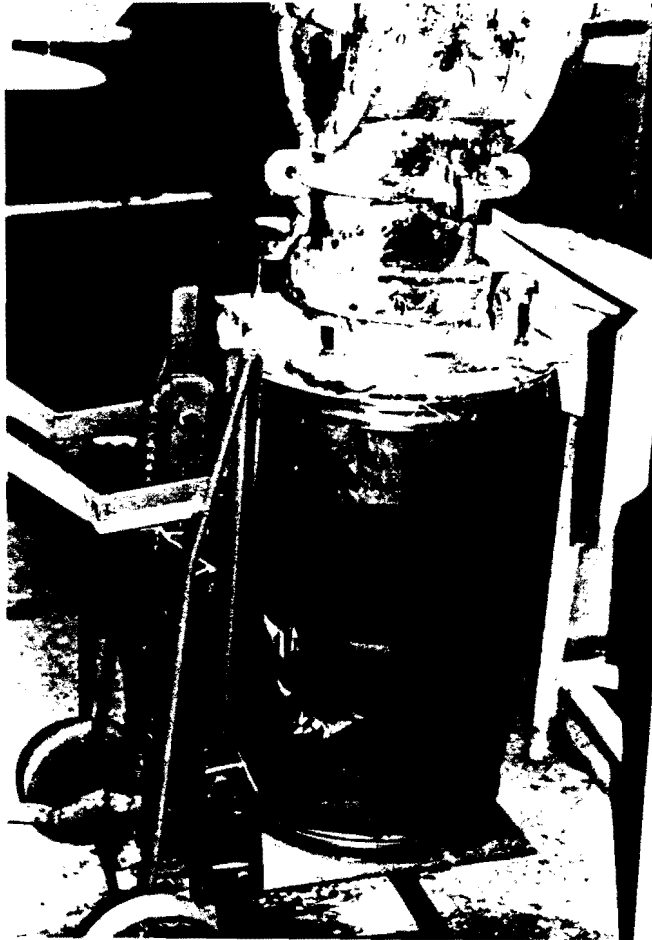
Figure 2. Exhaust Air Takeoff at Drum Loading Stand.