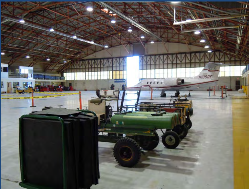
Interior of Hangar 481