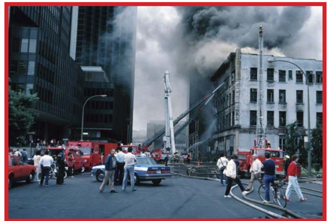
Monitoring and surveillance helps to document and track incident personnel health status during and after an incident

scope of injury and illness, and planning for the next event.