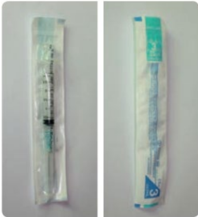
New and undamaged packaging